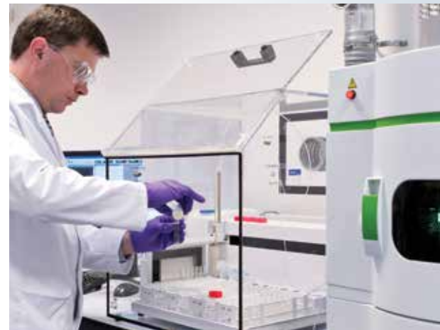
Atomic Emission Spectroscopy Analysis

We employ a large variety of modern analytical methods, such as inductively coupled plasma atomic emission spectroscopy (ICP-OES), inductively coupled plasma mass spectrometry (ICP-MS), flame atomic absorption spectroscopy (AAS) and graphite furnace AAS. This allows for specifically tailored control and analysis procedures for each product.